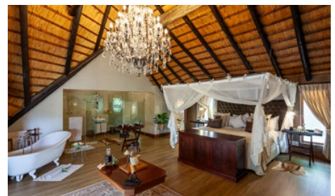
WATERBUCK PRIVATE CAMP